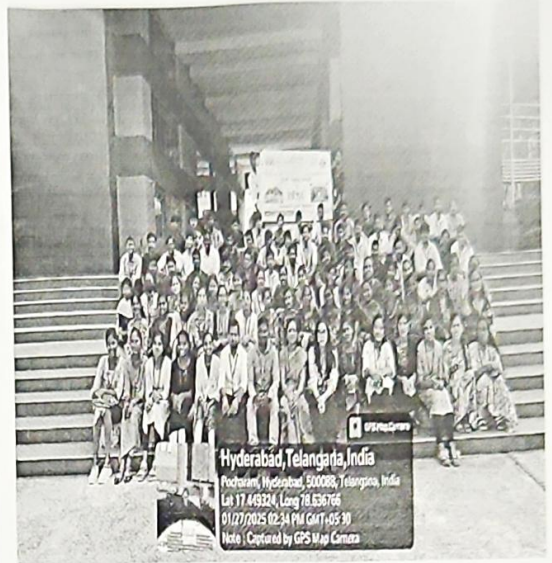
Students and staff group photo with Infosys Team.