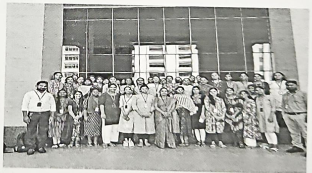
Infosys Employee interacting with the students.